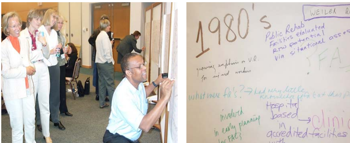
Reflecting on milestones from the 80's to the 2000's

Following opening remarks, and introductions, participants created a 25-foot Timeline of their collective history posted on the walls. Spanning the period from the 1980's to the 2000's, milestones and significant events related to individual participants, the world and functional assessments in Ontario were documented to help us appreciate and honour a shared picture of our history and values. This proved to be a fascinating experience with comments extending from music and fashion to the political pressures and celebrities of the day. To understand the meaning, trends were analyzed in small groups to explore areas of common values, perceptions and experiences.