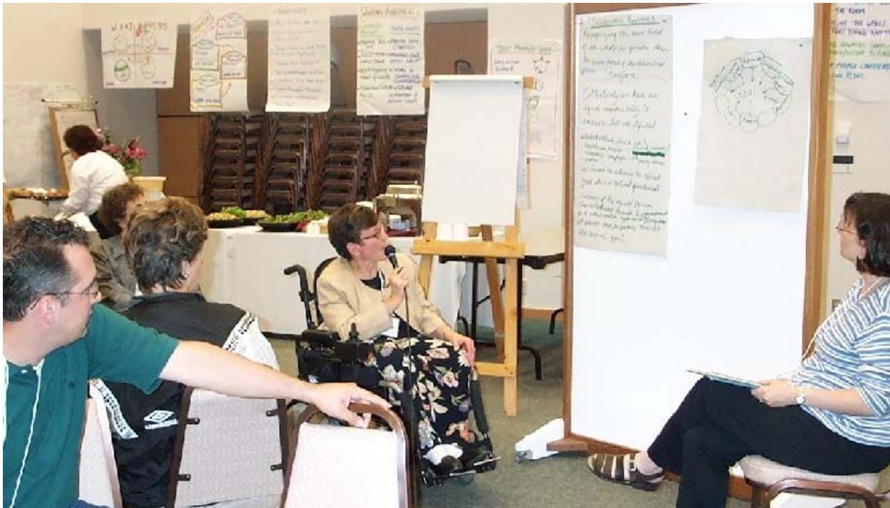
Planning for action