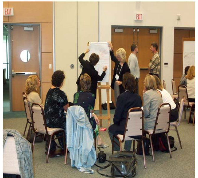
Stakeholders reflect on their 'prouds' and 'sorries'