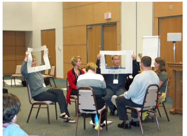
Dramatization of an ideal future for functional assessments