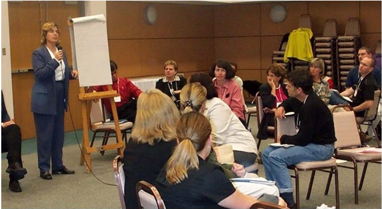
Each group discussed their goals and outlined potential actions to achieve those goals.